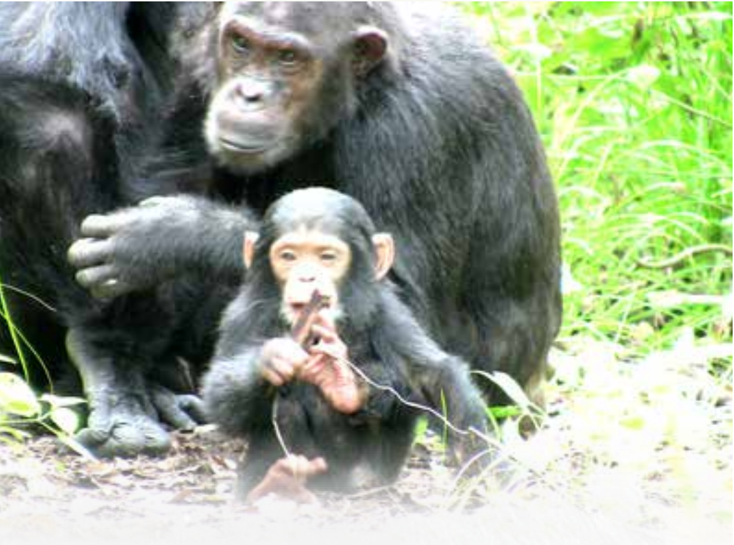
Welcome to Mahale Mountains National Park!

On the shores of Lake Tanganyika, the oldest and deepest lake in the world lies a pristine and remote park; the Mahale Mountains National Park. This park holds and protect the largest known population of chimpanzees, the jungle and the mountains. Visiting the park is a gratifying experience as you have a chance to carry chimp-trekking, hiking, snorkeling, sport fishing, boat ride, fly camping and bird watching.